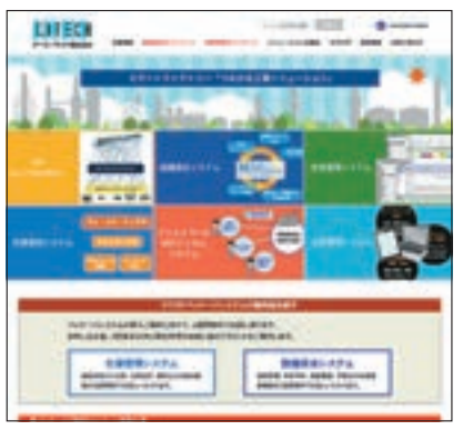
Broad lineup of self-developed software packages

From this fiscal year, the Company started to launch full-scale sales of its self-developed software package, which has been a focus of development for the purpose of building a new core industry. This package provides the facility maintenance system, inventory management system, production management system and other systems offered by the Company at a low cost and with a simple design, which can be customized for any type of business. We are happy to report that we have business with the manufacturing industry as well as many different industries across Japan. We remain actively committed to offering this package as well as new solutions utilizing AI, IoT and more to meet the needs of a wide range of customers regardless of type of business or industry.