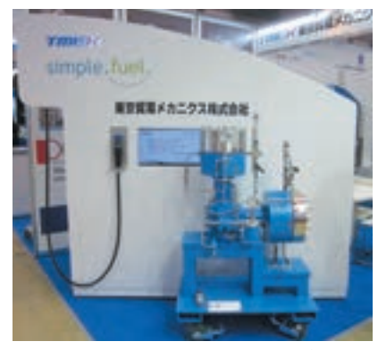
Exhibition booth at 14th International Hydrogen and Fuel Cell Expo

Then on November 14, 2017, the Hydrogen Glocal EXPO in Tokushima was held at ACTY Tokushima, and the Company also exhibited Simple Fuel there. Tokushima Prefecture is aiming to create a hydrogen society in an advanced and active manner, including formulating the Tokushima Prefecture Hydrogen Grid Concept. On the day of the expo, the exhibition venue bustled with many visitors from both inside and outside the prefecture, and the exhibition closed in great success.