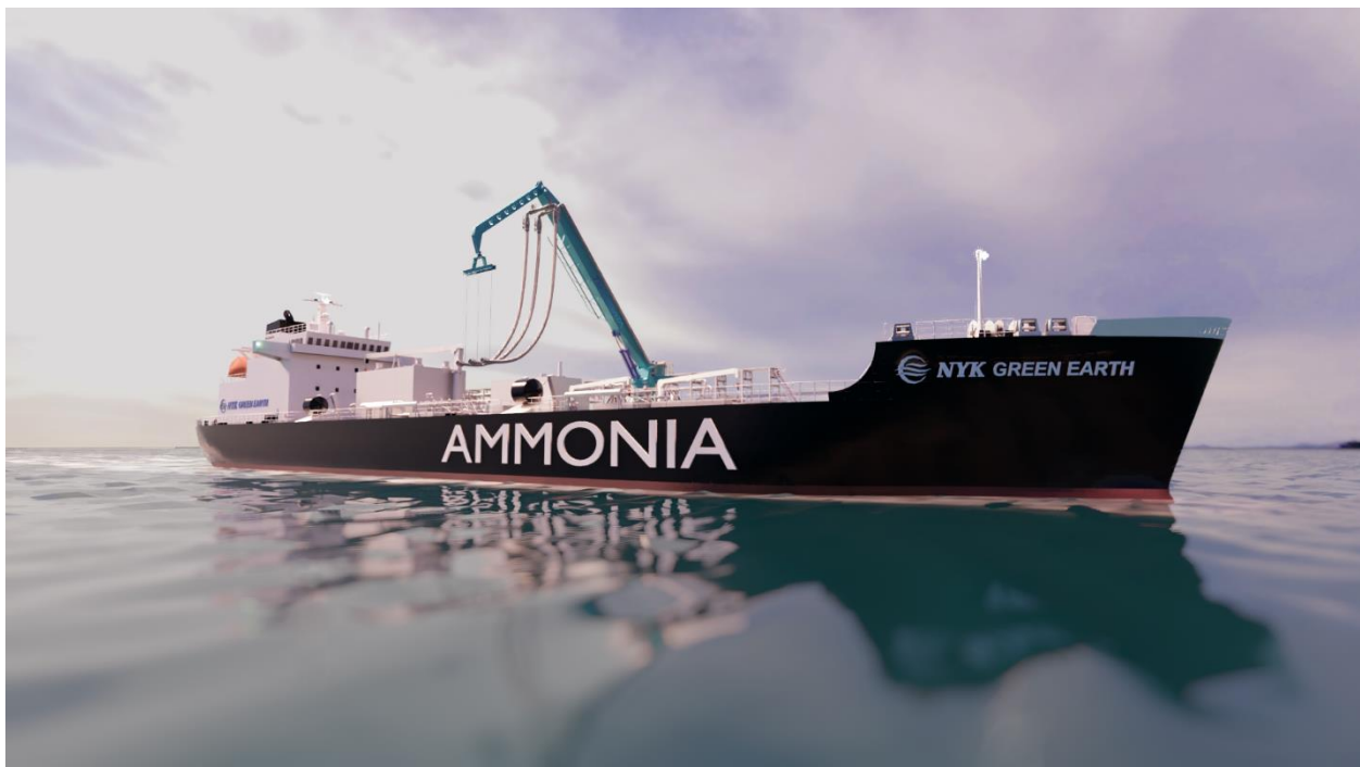
3D model of an ammonia fuel supply ship

TBG will continue to contribute to the sustainable development of the energy society and provide value to our stakeholders.